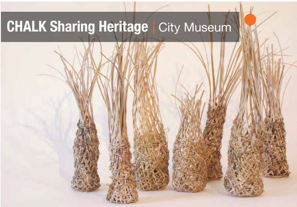
Woven vessels