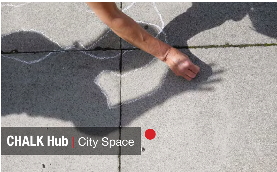
Drawing Together © Cheng-Chu Weng