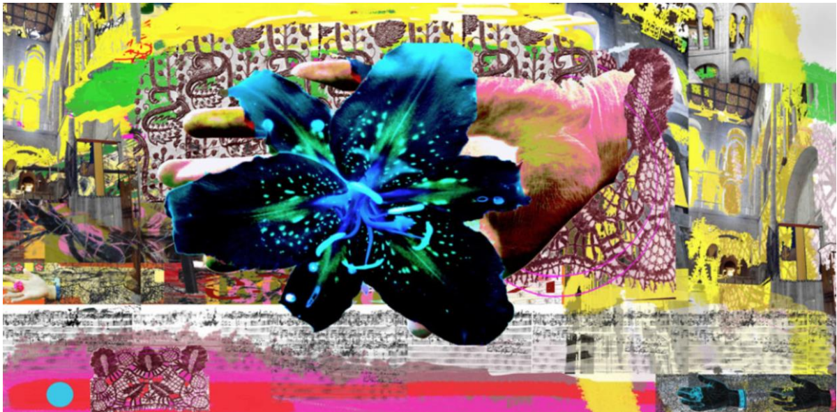
Offering © Alice Kettle and Stephen Cooper, Winchester Cathedral, 10 days 2013

Arts Council England, Hampshire Cultural Trust, Winchester School of Art, University of Winchester, Winchester Cathedral, Art and Sacred Places, Winchester City Council, Hampshire County Council, Theatre Royal Winchester, Winchester BID, The Observatory, SPUD, Badger Press, Rothmans, bulthaupt, peagreen, AR Design studio, Jewry Street Gallery, Joe Low Photographer, Dave Gibbons Photographer, Bang and Olufsen, Ocean Drive Living, Eastleigh College, Winchester Round Table, Justice British designer jewellery, The Corner House, Icathus Group, Toscanaccio, La Place, Art South, St Cross Hospital, Winchester Science Centre, Institute of Physics South West, South East Physics Network, Umbrella Winchester and Drawing Place.